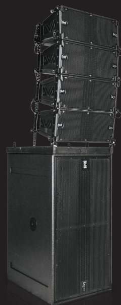
DVA K5 groundstacked with DVA KS20